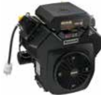
KOHLER 20 HP Command Pro CH640