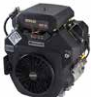
KOHLER 23 HP Command Pro CH680