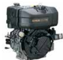
KOHLER 9.1 HP Kohler Diesel KD-440