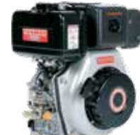
YANMAR 9.1 HP L100V