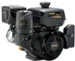
KOHLER 14 HP Command Pro CH440