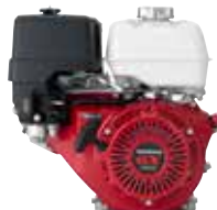
HONDA 13 HP GX390